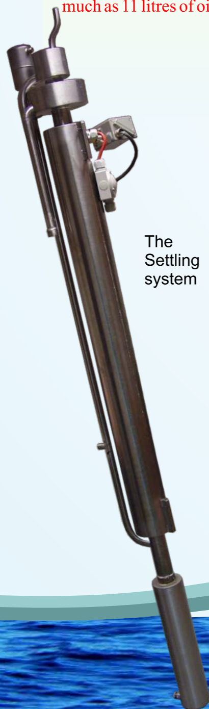
The Settling system

When using the patented settling system, the excess water is lead back to the bilge water and only pure oil is being pumped into the sludge tank. By reducing bilge water content in the waste oil tank, companies are cutting back on expenses. The conveyor collects as much as 11 litres of oil per hour.